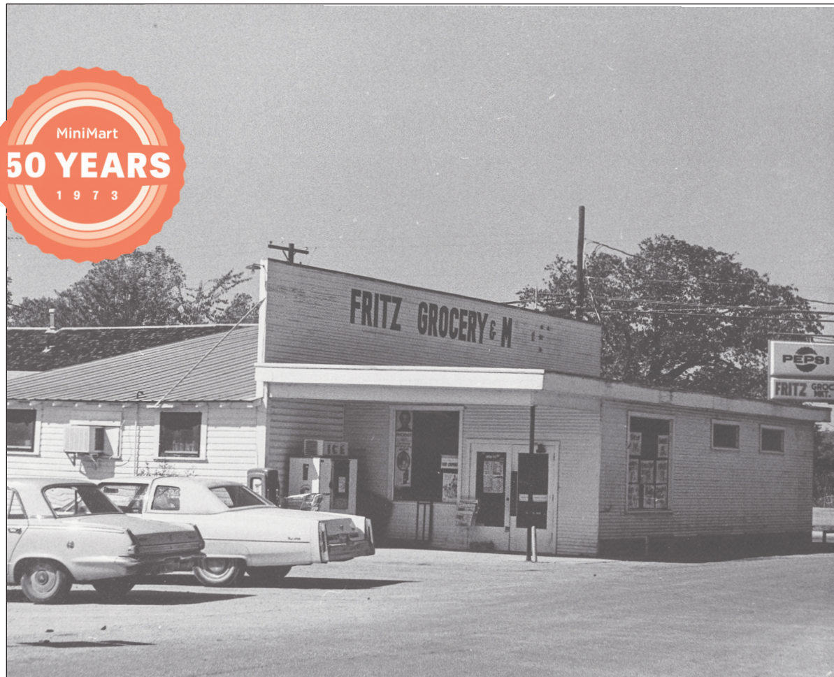
THE FIRST LOCATION for Mini Mart was opened in 1973 in Kerrville, a move that grew to become a fixture in the entire Hill Country and a legacy for the Fritz family.